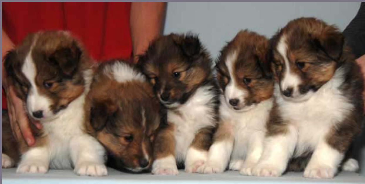
Pictured at 5 weeks old.

We have sable and white boys available to good companion homes. These puppies are just so cute!!!